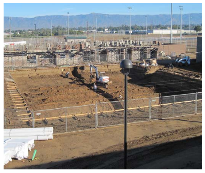
GRAND TERRACE HS (STADIUM, POOL, STUDENT SERVICES BLDG)

TOTAL BUDGET: $30 MILLION CONSTRUCTION: 51% COMPLETE