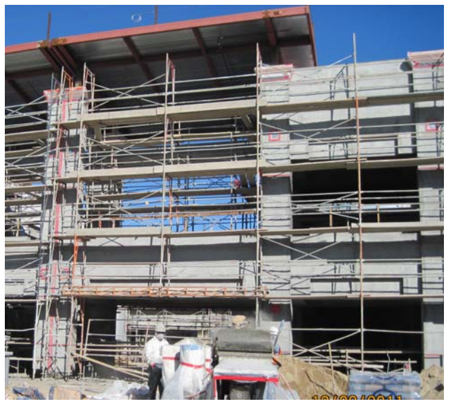
JOE BACA MIDDLE SCHOOL