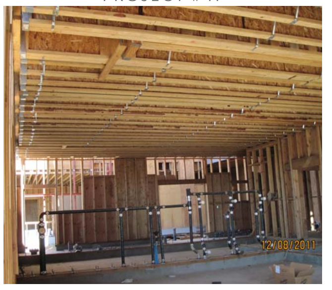
COLTON HS MATH & SCIENCE BLDG