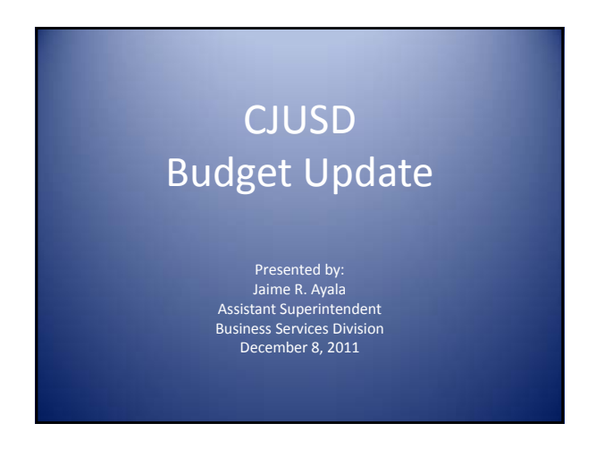
EXHIBIT A: Budget Update