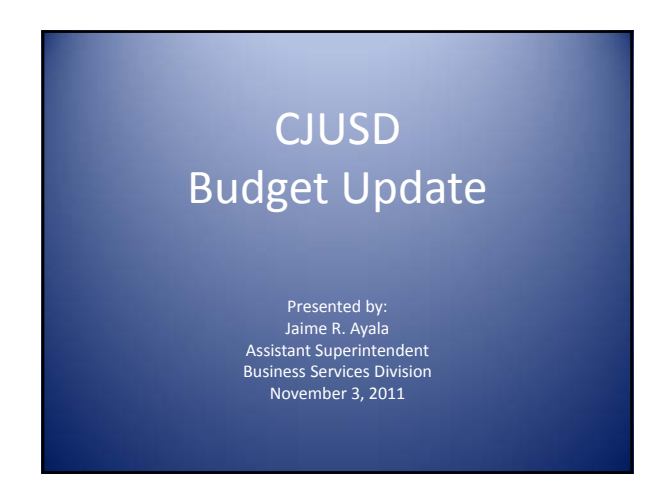
EXHIBIT A: Budget Update