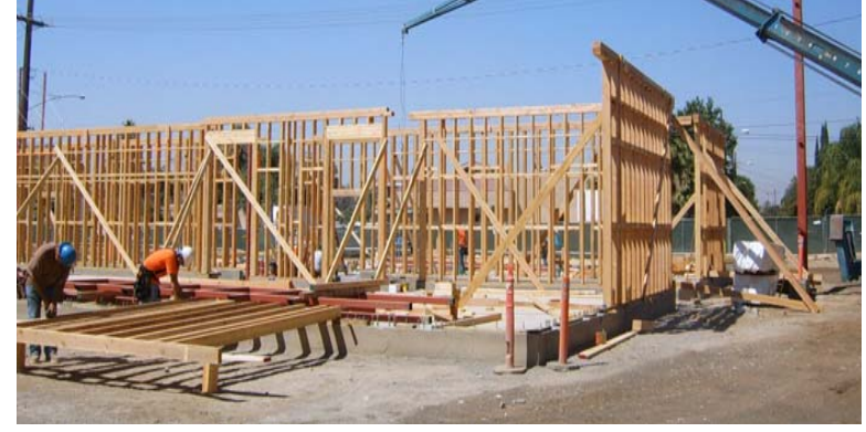
September 2011—With concrete foundation slab poured and cured, rough framing of first floor science building is underway

The building's central staircase and bridge are exposed steel. The main staircase wraps around an elevator tower with a canopy consisting of exposed cantilevered steel beams and corrugated metal roof. The stair is protected by steel mesh screens and its canopy rises high above the other roofs of the building to form an entry tower for the west side of the campus. The tower also supports large scale school signage.