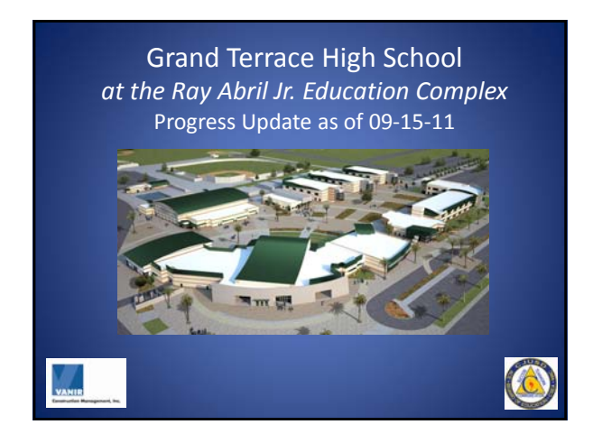
EXHIBIT I: Facilities Update - GTHS