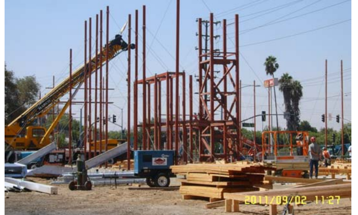
BLOOMINGTON HS MATH&SCIENCE BLDG