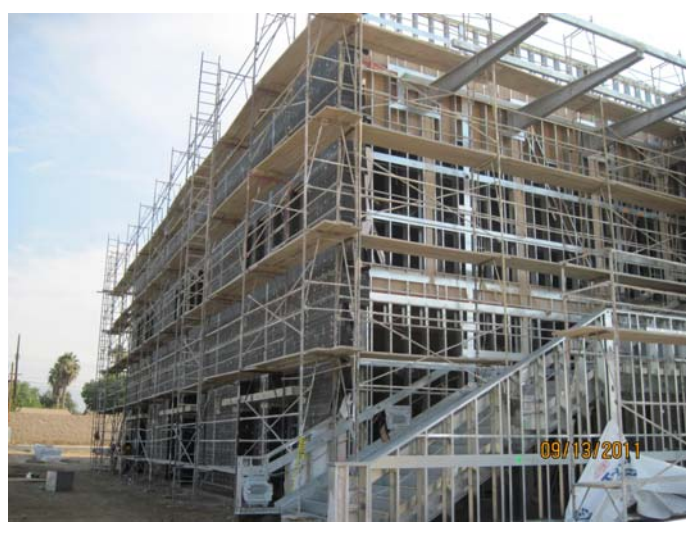
GRAND TERRACE HIGH SCHOOL