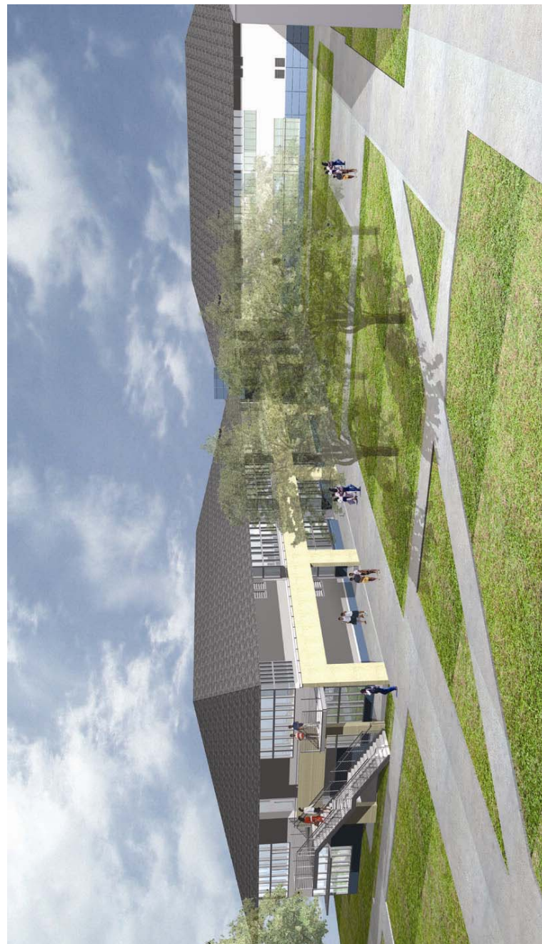
BHS MATH & SCIENCE BUILDING—ARTIST'S RENDERING INTERIOR COURTYARD