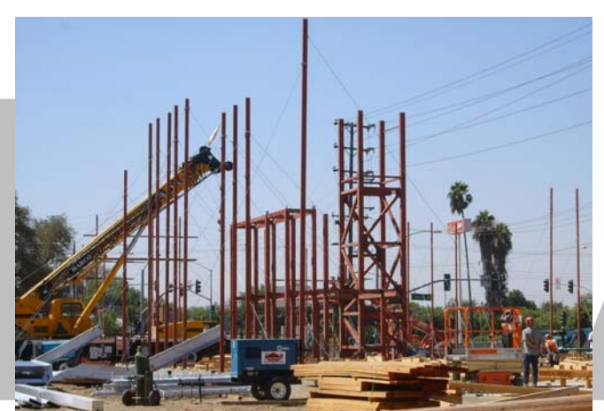
August 2011—project goes vertical with placement of structural steel for stair/elevator tower

Colton High School is located in the City of Colton in San Bernardino County 60 miles east of Los Angeles and is part of the Colton Joint Unified School District. The math and science building currently under construction is a two story, 50,000 square foot structure, laid in an 'L' shaped configuration consisting of math and science wings connected by a bridge, elevator and stair component. The science wing is oriented in a north and south axis containing twelve 960 square foot classrooms; six fully equipped 1,300 square foot science labs and four 360 square foot prep rooms. The math wing is oriented in an east and west axis containing