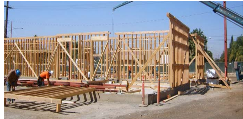
September 2011—With concrete foundation slab poured and cured, rough framing of first floor science building is underway

The building's central staircase and bridge are exposed steel. The main staircase wraps around an elevator tower with a canopy consisting of exposed cantilevered steel beams and corrugated metal roof. The stair is protected by steel mesh screens and its canopy rises high above the other roofs of the building to form an entry tower for the west side of the campus. The tower also supports large scale school signage.