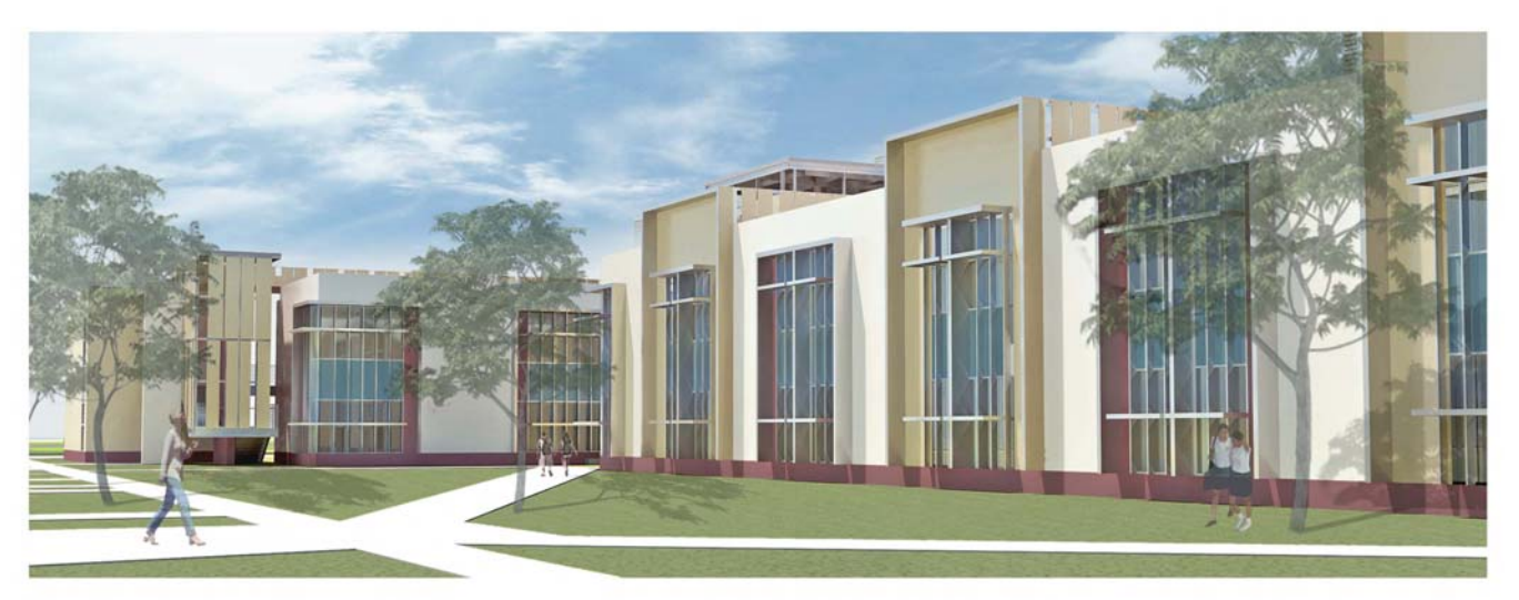
CHS MATH & SCIENCE BUILDING—Artist's rendering of interior courtyard