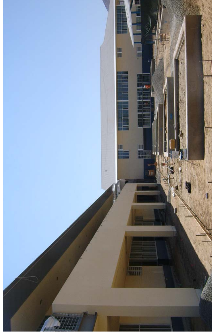
BHS MATH & SCIENCE BUILDING—INTERIOR COURTYARD (as of August 29, 2011)