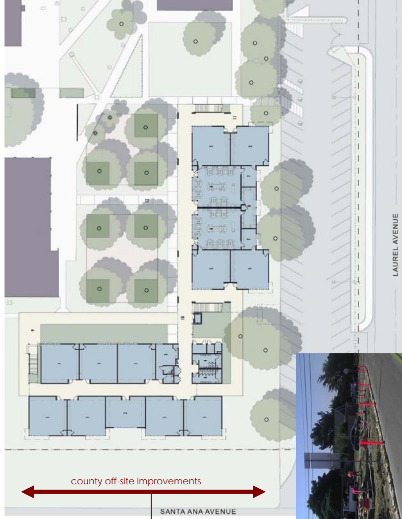
BHS MATH & SCIENCE BUILDING—SITE PLAN

County off-site improvements along Santa Ana are underway and consist of sidewalks, curb and gutter, and street paving.