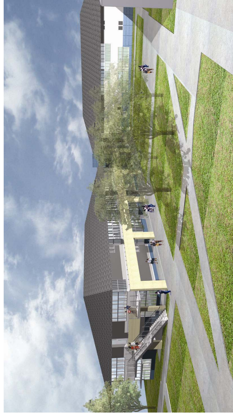
BHS MATH & SCIENCE BUILDING—ARTIST'S RENDERING INTERIOR COURTYARD

Aesthetically, the building consists of a stucco finish with phenolic (high pressure decorative compact laminate) panels surrounding the entire base of both wings. The math wing has classrooms flanking a central corridor, whereas the science wing incorporates a west facing arcade on the first floor, and an access balcony on the second. The two wings are capped with deeply projecting hipped roofs with asphalt shingles pitched at a 4:12 ratio to match the dominant classroom form on the rest of the campus.